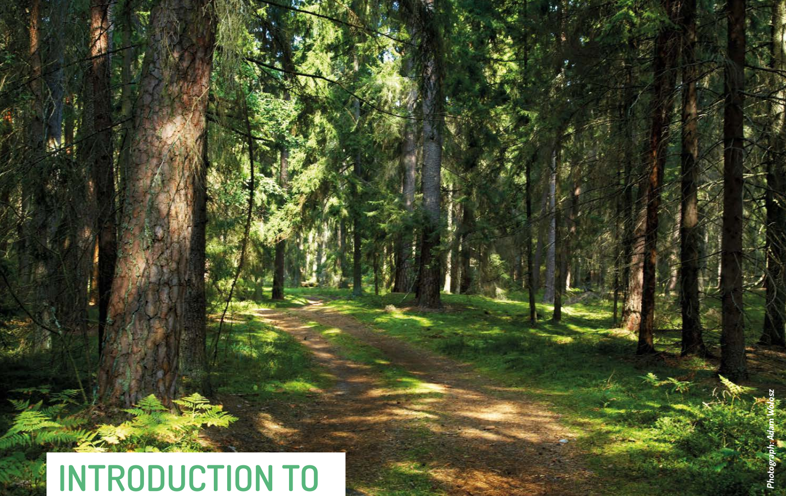
Photograph: Adam Wółośz