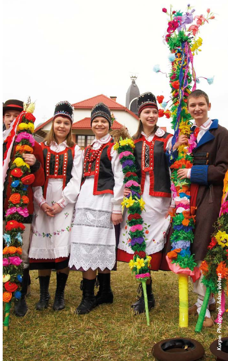
Kurpie, Photograph: Adam Wółośz

Furthermore, the region is located on the crossroads of the national and international routes leading from west to east and from north to south, what is a significant advantage supporting the local economy and development of transport infrastructure. It is worth mentioning that, among others, two important railroads connecting Warsaw with Brest and Hrodna are located here.