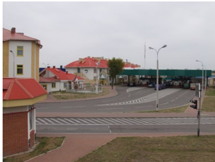
Modern and efficient border crossings are crucial for cross-border cooperation

With great pleasure we would like to inform that the Cross-border Cooperation Programme Poland-Belarus-Ukraine 2007-2013 is the first Programme among all other ENPI Programmes which has managed to successfully select the first LSPs! The European Commission approved the full application forms of two LSPs which soon will sign contracts with the Joint Managing Authority. At the same time, until now six further LSP Project Summaries were already approved by the EC and the full application forms are under preparation. The last Project Summary is under preparation.