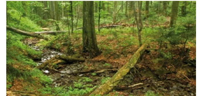
6. Primeval Beech Forests of the Carpathians (Ukraine/Slovakia)