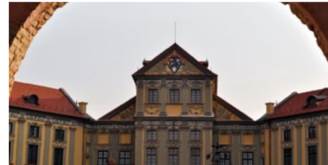
1. Architectural, Residential and Cultural Complex of the Radziwill Family in Niasviž (Belarus)

There are 8 UNESCO World Heritage Sites on the Programme territory including 3 transboundary sites. We have the pleasure to present these “gifts from the Past to the Future” (source: whc.unesco.org):