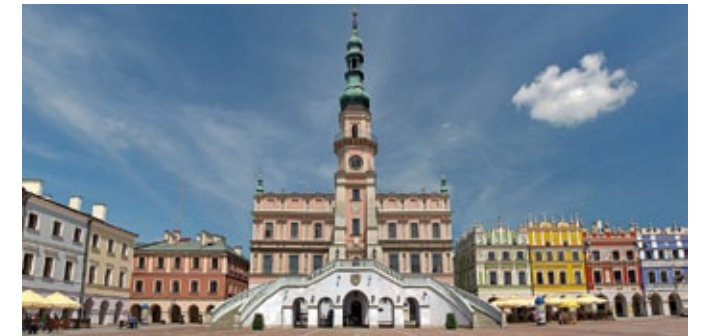
5. Old City of Zamość (Poland)