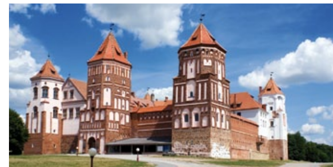
4. Mir Castle Complex (Belarus)