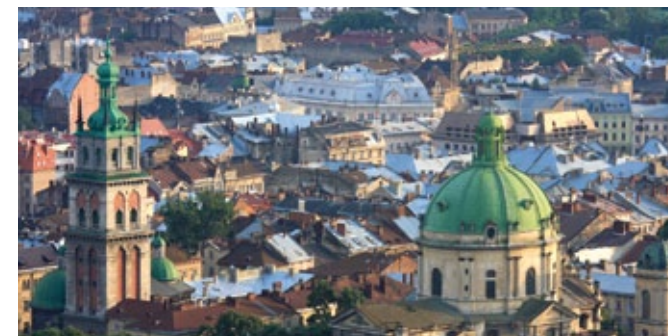
3. Lviv - the Ensemble of the Historic Centre (Ukraine)