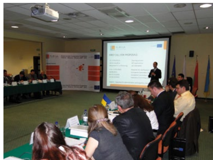
JMC meeting 23.11.2010

The Joint Monitoring Committee during its third meeting (which took place on 23-24 November 2010) decided to approve the list of 21 projects, which shall be funded within the 1st Call for Proposals. The maximum total value of the selected projects exceeds the budget allocated for the 1st Call.