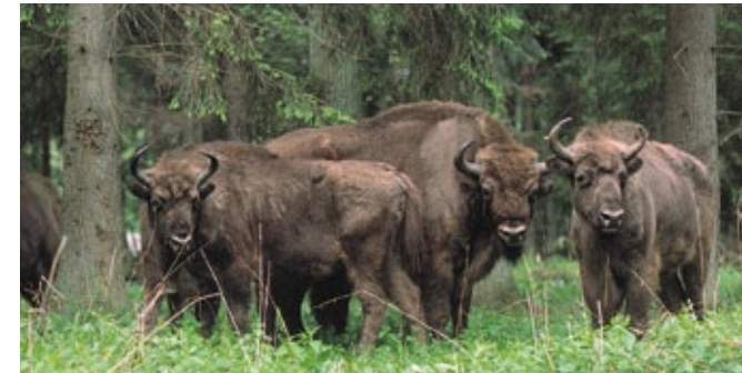
2. Virgin forests of Bielaviežskaja Pušča / Puszcza Białowieża (Belarus/ Poland)