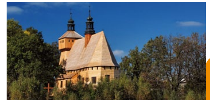
8. Wooden Churches of Southern Little Poland (Poland)